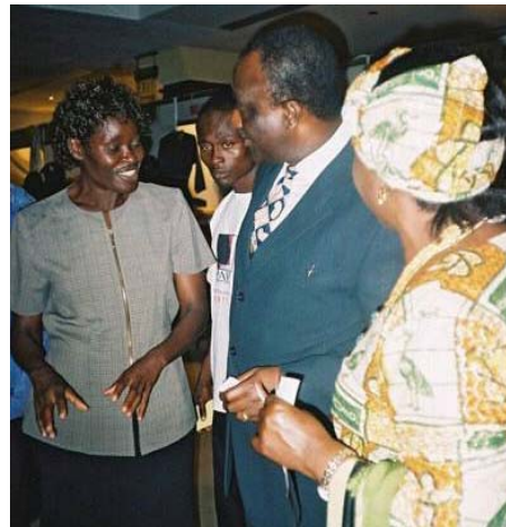
Ghana's Trade and Industry Minister with an exhibitor at the PAWII event

new ideas, ensure their ideas are protected, react to changing markets and engage with their customers. Contributors from across Africa, Europe and North America addressed key issues facing inventors and innovators and focused on how to create innovative market opportunities in Africa, build capacity and secure finance and investment.